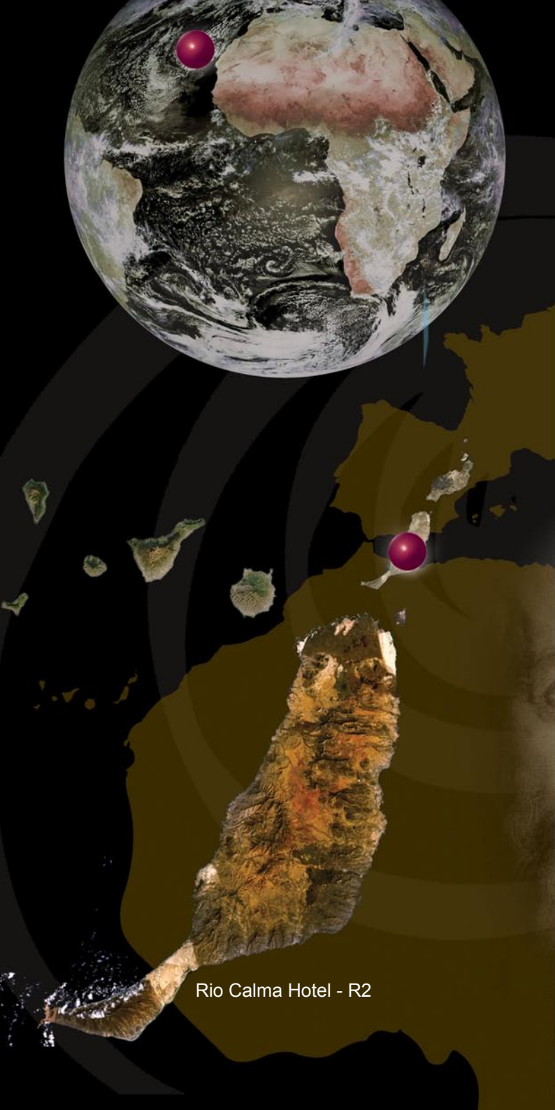
Rio Calma Hotel - R2